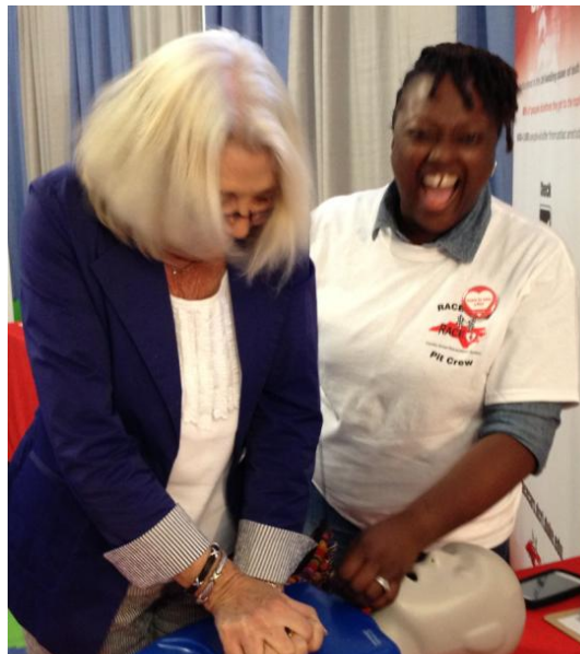
So easy, even the “elevator lady” can do it!

53 attendees from North and South Carolina at the RACE/ACC Meeting in Asheville